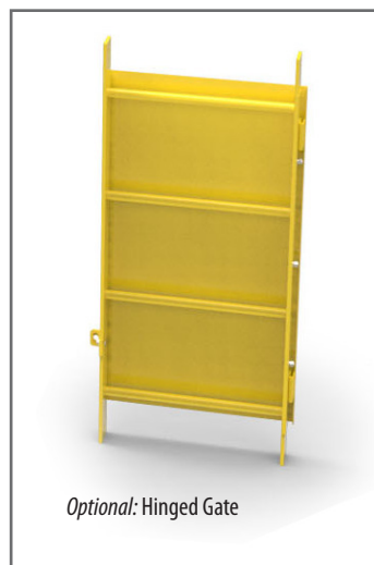
Optional: Hinged Gate

NOTE: All application requirements are different depending on site conditions. Acudor has provided their Ladder System in modular parts to allow a perfect fit for all uses. All components are sold separately. See a parts list and sample reference on the back of this page.